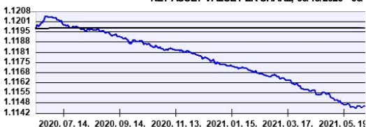
NET ASSET VALUE PER SHARE, 06/15/2020 - 06/14/2021

— Aegon Polish Money Market Fund institutional series — Benchmark