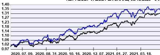
NET ASSET VALUE PER SHARE, 06/16/2020 - 04/30/2021

— Aegon MegaTrend Equity Fund of Funds P series — Benchmark