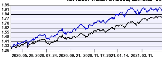
NET ASSET VALUE PER SHARE, 05/01/2020 - 04/30/2021

— Aegon MegaTrend Equity Fund of Funds HUF series — Benchmark