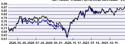
NET ASSET VALUE PER SHARE, 05/01/2020 - 04/30/2021

— Aegon Polish Equity Fund PLN series — Benchmark