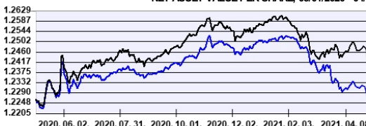
NET ASSET VALUE PER SHARE, 05/01/2020 - 04/30/2021

— Aegon Polish Bond Fund P series — Benchmark