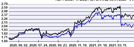
NET ASSET VALUE PER SHARE, 05/01/2020 - 04/30/2021

— Aegon Istanbul Equity Fund TRY series — Benchmark