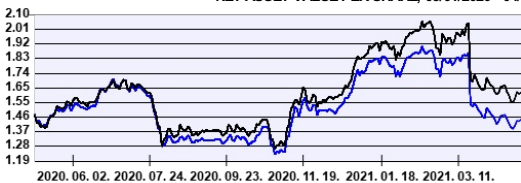
NET ASSET VALUE PER SHARE, 05/01/2020 - 04/30/2021

— Aegon IstanBull Equity Fund institutional series — Benchmark