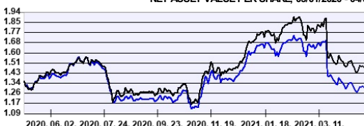
NET ASSET VALUE PER SHARE, 05/01/2020 - 04/30/2021

— Aegon Istanbul Equity Fund HUF series — Benchmark