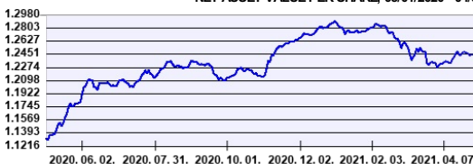
NET ASSET VALUE PER SHARE, 05/01/2020 - 04/30/2021

— Aegon Emerging Europe Bond Fund USD series