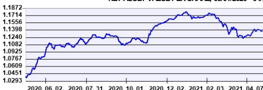
NET ASSET VALUE PER SHARE, 05/01/2020 - 04/30/2021

— Aegon Emerging Europe Bond Fund institutional series