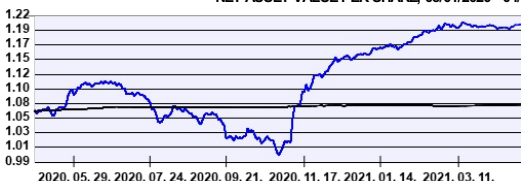
NET ASSET VALUE PER SHARE, 05/01/2020 - 04/30/2021

— Aegon Alfa Absolute Return Investment Fund USD series — Benchmark