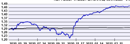
NET ASSET VALUE PER SHARE, 05/01/2020 - 04/30/2021

— Aegon Alfa Absolute Return Investment Fund R series — Benchmark