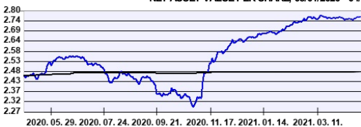
NET ASSET VALUE PER SHARE, 05/01/2020 - 04/30/2021

— Aegon Alfa Absolute Return Investment Fund PLN series — Benchmark