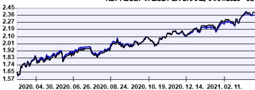
NET ASSET VALUE PER SHARE, 04/01/2020 - 03/31/2021

— Aegon International Equity Fund institutional series — Benchmark