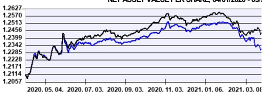
NET ASSET VALUE PER SHARE, 04/01/2020 - 03/31/2021

— Aegon Polish Bond Fund P series — Benchmark