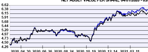
NET ASSET VALUE PER SHARE, 04/01/2020 - 03/31/2021

— Aegon Central European Equity Fund institutional series — Benchmark