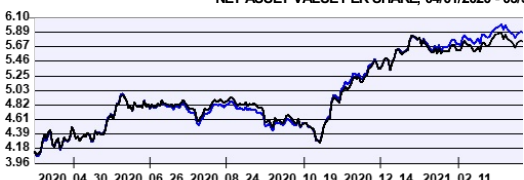
NET ASSET VALUE PER SHARE, 04/01/2020 - 03/31/2021

— Aegon Central European Equity Fund HUF series — Benchmark