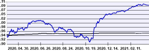
NET ASSET VALUE PER SHARE, 04/01/2020 - 03/31/2021

Past performance is no guarantee of future results. This report should not be considered as an offer or investment advisory. The Fund Prospectus contains the detailed conditions of the investment. The distribution costs of the fund purchase can be found at the distributors.