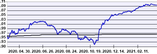
NET ASSET VALUE PER SHARE, 04/01/2020 - 03/31/2021

Past performance is no guarantee of future results. This report should not be considered as an offer or investment advisory. The Fund Prospectus contains the detailed conditions of the investment. The distribution costs of the fund purchase can be found at the distributors.