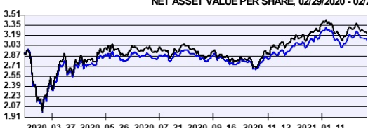
NET ASSET VALUE PER SHARE, 02/29/2020 - 02/28/2021

— Aegon Russia Equity Fund HUF series — Benchmark