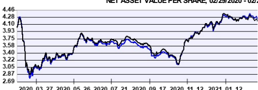
NET ASSET VALUE PER SHARE, 02/29/2020 - 02/28/2021

— Aegon Central European Equity Fund EUR series — Benchmark