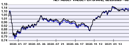
NET ASSET VALUE PER SHARE, 02/29/2020 - 02/28/2021

— Aegon Central European Equity Fund CZK series — Benchmark