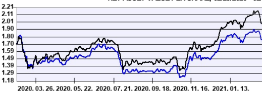
NET ASSET VALUE PER SHARE, 02/29/2020 - 02/28/2021

Past performance is no guarantee of future results. This report should not be considered as an offer or investment advisory. The Fund Prospectus contains the detailed conditions of the investment. The distribution costs of the fund purchase can be found at the distributors.