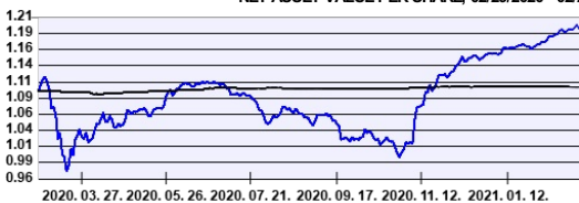
NET ASSET VALUE PER SHARE, 02/29/2020 - 02/28/2021

— Aegon Alfa Absolute Return Investment Fund USD series — Benchmark