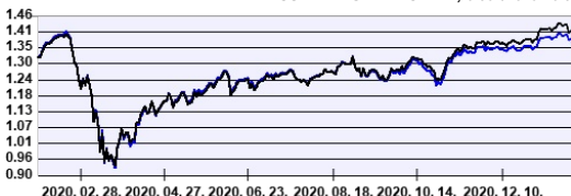
NET ASSET VALUE PER SHARE, 02/01/2020 - 01/31/2021

— Aegon International Equity Fund EUR series — Benchmark