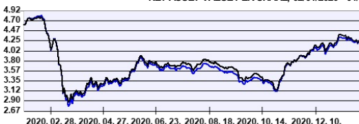
NET ASSET VALUE PER SHARE, 02/01/2020 - 01/31/2021

Past performance is no guarantee of future results. This report should not be considered as an offer or investment advisory. The Fund Prospectus contains the detailed conditions of the investment. The distribution costs of the fund purchase can be found at the distributors.