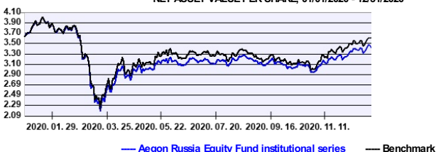
NET ASSET VALUE PER SHARE, 01/01/2020 - 12/31/2020

Past performance is no guarantee of future results. This report should not be considered as an offer or investment advisory. The Fund Prospectus contains the detailed conditions of the investment. The distribution costs of the fund purchase can be found at the distributors.