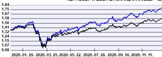
NET ASSET VALUE PER SHARE, 01/01/2020 - 12/31/2020

— Aegon MegaTrend Equity Fund of Funds HUF series — Benchmark