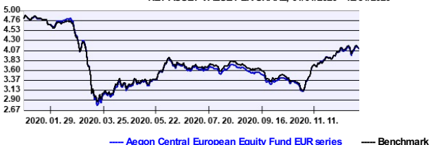
NET ASSET VALUE PER SHARE, 01/01/2020 - 12/31/2020

Past performance is no guarantee of future results. This report should not be considered as an offer or investment advisory. The Fund Prospectus contains the detailed conditions of the investment. The distribution costs of the fund purchase can be found at the distributors.