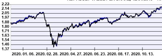
NET ASSET VALUE PER SHARE, 12/01/2019 - 11/30/2020

— Aegon International Equity Fund institutional series — Benchmark