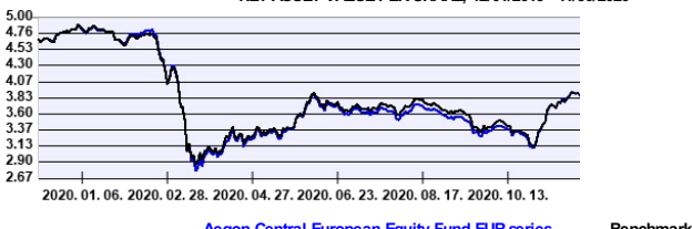
NET ASSET VALUE PER SHARE, 12/01/2019 - 11/30/2020

Past performance is no guarantee of future results. This report should not be considered as an offer or investment advisory. The Fund Prospectus contains the detailed conditions of the investment. The distribution costs of the fund purchase can be found at the distributors.