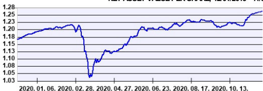
NET ASSET VALUE PER SHARE, 12/01/2019 - 11/30/2020

— Aegon Emerging Europe Bond Fund USD series