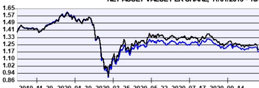
NET ASSET VALUE PER SHARE, 11/01/2019 - 10/31/2020

— Aegon Russia Equity Fund PLN series — Benchmark