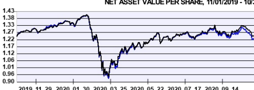
NET ASSET VALUE PER SHARE, 11/01/2019 - 10/31/2020

— Aegon International Equity Fund EUR series — Benchmark