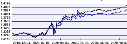
NET ASSET VALUE PER SHARE, 11/01/2019 - 10/31/2020

— Aegon Polish Bond Fund Institutional series — Benchmark