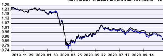
NET ASSET VALUE PER SHARE, 11/01/2019 - 10/31/2020

— Aegon Central European Equity Fund CZK series — Benchmark