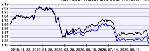
NET ASSET VALUE PER SHARE, 11/01/2019 - 10/31/2020

— Aegon Istanbul Equity Fund institutional series — Benchmark