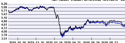
NET ASSET VALUE PER SHARE, 10/01/2019 - 09/30/2020

— Aegon Central European Equity Fund HUF series — Benchmark