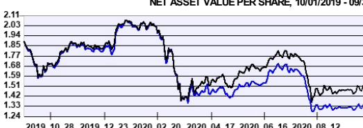
NET ASSET VALUE PER SHARE, 10/01/2019 - 09/30/2020

— Aegon Istanbul Equity Fund institutional series — Benchmark