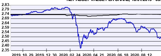
NET ASSET VALUE PER SHARE, 10/01/2019 - 09/30/2020

— Aegon Alfa Total Return Investment Fund HUF series — Benchmark