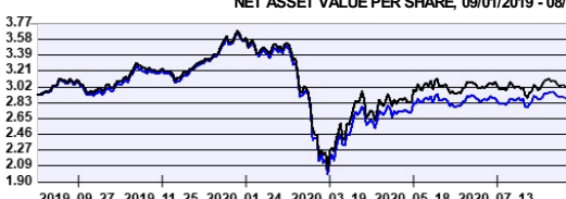
NET ASSET VALUE PER SHARE, 09/01/2019 - 08/31/2020

— Aegon Russia Equity Fund HUF series — Benchmark