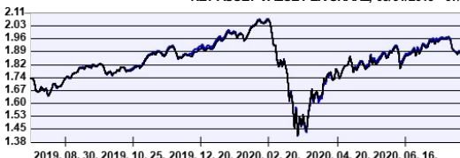
NET ASSET VALUE PER SHARE, 08/01/2019 - 07/31/2020

— Aegon International Equity Fund institutional series — Benchmark