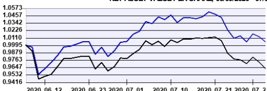
NET ASSET VALUE PER SHARE, 06/09/2020 - 07/31/2020

— Aegon MegaTrend Equity Fund of Funds PI series — Benchmark