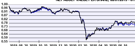
NET ASSET VALUE PER SHARE, 08/01/2019 - 07/31/2020

— Aegon Polish Equity Fund PLN series — Benchmark