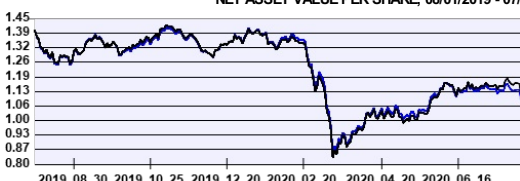
NET ASSET VALUE PER SHARE, 08/01/2019 - 07/31/2020

— Aegon Polish Equity Fund HUF series — Benchmark