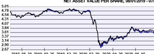
NET ASSET VALUE PER SHARE, 08/01/2019 - 07/31/2020

— Aegon Central European Equity Fund EUR series — Benchmark