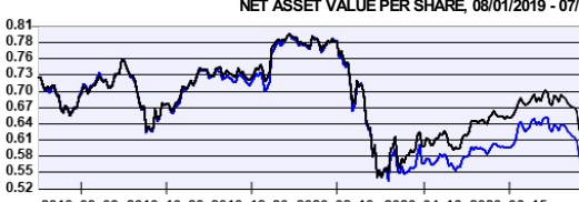
NET ASSET VALUE PER SHARE, 08/01/2019 - 07/31/2020

— Aegon Istanbul Equity Fund PLN series — Benchmark