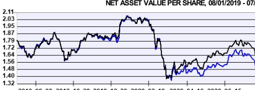
NET ASSET VALUE PER SHARE, 08/01/2019 - 07/31/2020

— Aegon Istanbul Equity Fund institutional series — Benchmark