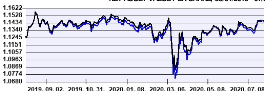
NET ASSET VALUE PER SHARE, 08/01/2019 - 07/31/2020

— Aegon Domestic Bond Fund institutional series — Benchmark