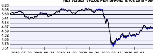
NET ASSET VALUE PER SHARE, 07/01/2019 - 06/30/2020

Past performance is no guarantee of future results. This report should not be considered as an offer or investment advisory. The Fund Prospectus contains the detailed conditions of the investment. The distribution costs of the fund purchase can be found at the distributors.